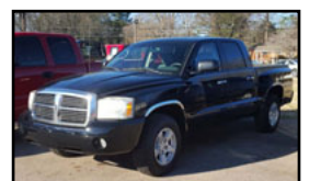
'05 Dodge Dakota 4 Door, 4X4, Leather! Test Drive Me! Stk#514