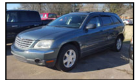
'06 Chrysler Pacifica Leather, Sunroof, Loaded! Great Family Car Stk#616