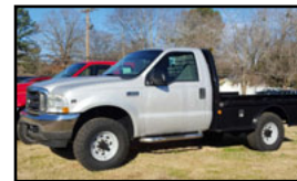
'02 Ford F250 Superduty Local Trade, Flat Red, 4X4, 6 Speed! Stk#571