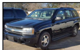
'07 Chevy Trailblazer Clean Vehicle, Great Condition! Test Drive Me! Stk#603