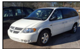
'06 Dodge Caravan Leather, Sunroof, 4 Captain Chairs! Stor-N-Go! Stk#482

925 Locust Street • Paris • 731-642-5300