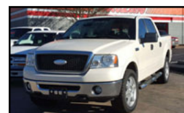
'09 Ford F150 Supercrew 4 Door, 4X4, Leather! Sunroof, Loaded! Stk#607