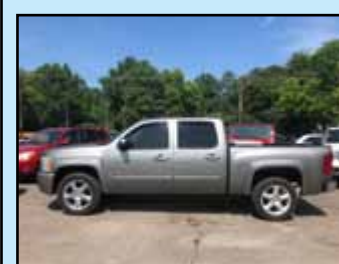
'08 Chevy Silverado Vortec MAX 4 Door, 4X4! Stk#767