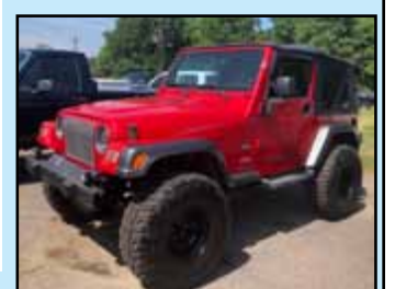
'04 Jeep Wrangler Columbia Edition 4X4, 5 Speed, Lift Kit! Stk#735C