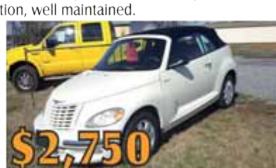
2005 Chrysler PT Crusier Conv. 134,xxx miles, rebuilt title