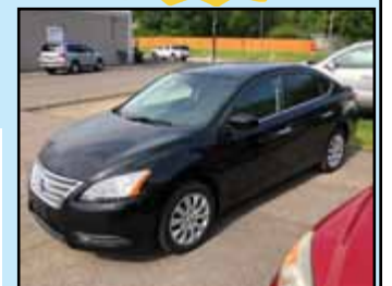
'13 Nissan Sentra Good Gas Mileage, Extra Clean! Stk#790