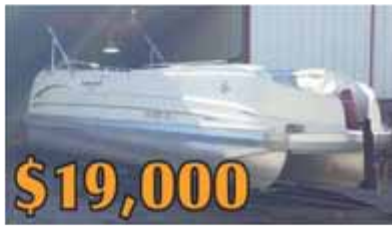
2002 JC MFG Evolution 260 Tritoon 350 Chevy motor, Lots of power and a very smooth ride, comes with trailer, mint condition, well maintained.