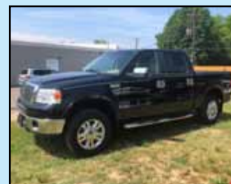
'08 Ford Lariat 4 Door, 4X4, Keyless Entry, Sunroof Loaded! Stk#787