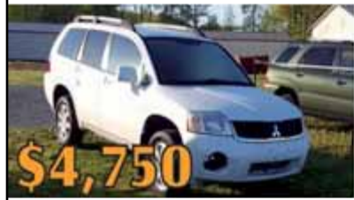
2011 Mitsubishi Endeavor White, AWD, 140,xxx miles