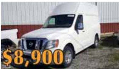
2012 Nissan NV2500 Van White, 212,xxx miles