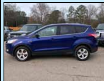
'15 Ford Escape SE Eco Boost, 4 WD, Nice! Stk#781