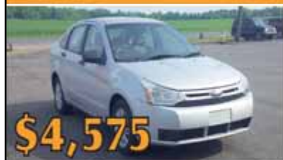
2011 Ford Focus Silver, 64,xxx miles