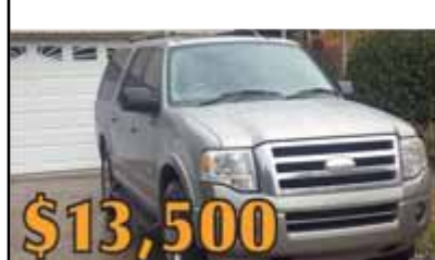
2008 Ford Expedition EL Limited 4WD, silver, 155,xxx Hwy. miles, 1 owner, garage kept