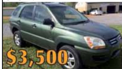
2006 KIA Sportage LX 4WD 160,xxx miles