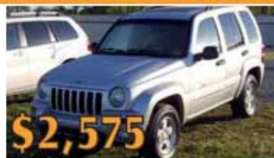
2002 Jeep Liberty 4x4 w/ equip to tow behind camper, 179,xxx miles