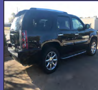
'07 GMC Denali TN Vehicle, FULLY LOADED, Rear Cap. Seats DVD, Leather, Navigation, 4 WD! Stk#675