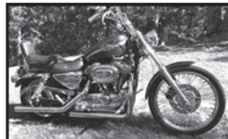
2003 HARLEY DAVIDSON, Anniversary Edition 1200, great shape, 11,300 miles. $4,200 901-237-0966

2003 RED HONDA Shadow 750. Only 5,200 miles. Excellent condition. Comes with a large leather coat, 2 helmets and a tarp for covering. $3,000 firm. Call 731-642-0600 to ride and see.