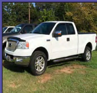
'04 Ford F150 Lariat 4 Door, Ext. Cab, 4X4, Leather! Stk#702