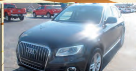
2014 AUDI Q5 53,484 MILES | Black Book: $32,850 2 STOCK # P2389 | Joe's Price: $26,950 1