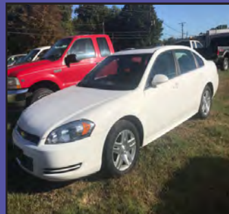
'13 Chevrolet Impala Cloth, Sunroof, Very Nice! Stk#711