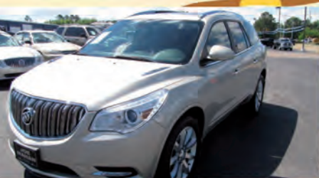
2015 BUICK ENCLAVE 10,992 MILES | Black Book: $39,575 2 STOCK # P2388 | Joe's Price: $31,975 1