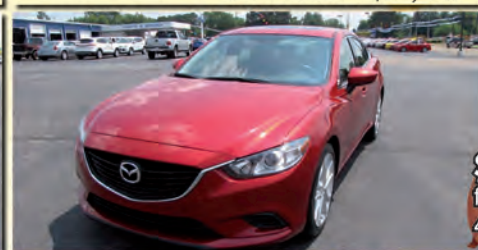
2016 MAZDA 6 15,427 MILES | Black Book: $23,075 2 STOCK # P2410 | Joe's Price: $20,600 1