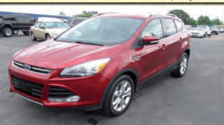
2015 FORD ESCAPE 5,014 MILES | Black Book: $23,625 2 STOCK # P2383 | Joe's Price: $18,900 1