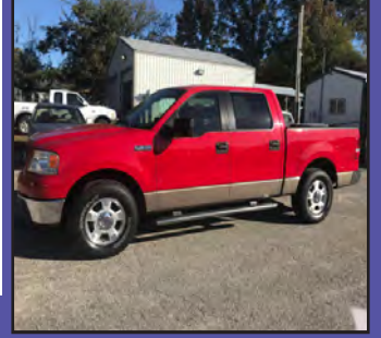
'06 Ford F150 Crew Cab 2WD, Cloth, Extremely Clean! Stk#714