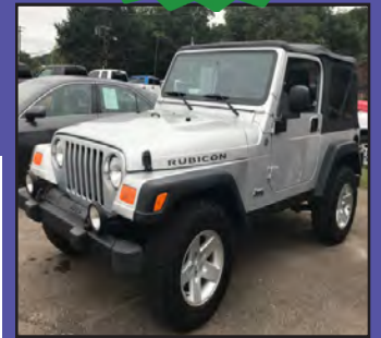
'04 Jeep Rubicon 6 Cyl, Straight Shift, Leather, AC, Extremely Clean! Stk#707