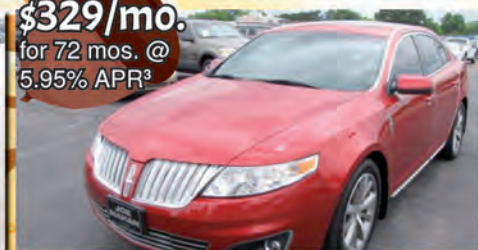
2012 LINCOLN MKS $329/mo. for 72 mos. @ 5.95% APR 3 35,580 MILES | Black Book: $20,325 2 STOCK # T7460A | Joe's Price: $18,575 1