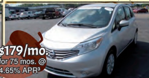
2016 NISSAN VERSA NOTE $179/mo. for 75 mos. @ 4.65% APR 3 35,501 MILES | Black Book: $14,150 2 STOCK # P2409 | Joe's Price: $10,775 1