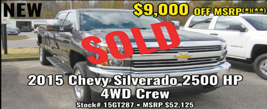
2015 Chevy Silverado 2500 HP 4WD Crew