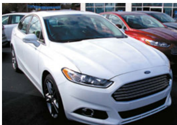
2016 Ford Fusion Titanium FWD Stock# 4489