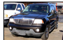
'05 Lincoln Aviator Leather, Loaded, Keyless Entry! Stk#585R