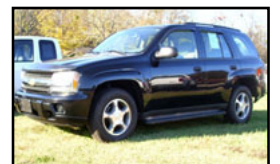
'07 Chevy Trailblazer Must See! Extremely Clean! Stk#603