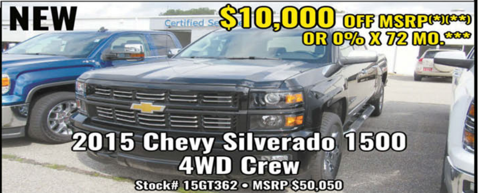
2015 Chevy Silverado 1500 4WD Crew

$10,000 OFF MSRP(*)(**) OR 0% X 72 MO.***