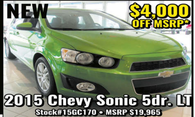
2015 Chevy Sonic 5dr. LT