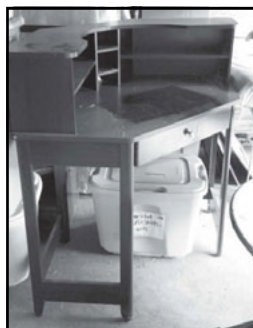
CORNER DESK $70 OBO. 2 SETS FULL SIZED Bedrails. $20 each 731-336-5692

CLASSIFIED DEADLINE for November 26th paper will be FRIDAY, NOVEMBER 20TH by 5pm.