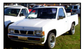
'93 Nissan Truck Toolbox, New Tires, One Owner! Stk#600

MULTIPLE FINANCING OPTIONS AVAILABLE! BUY • SELL • TRADE WE FINANCE!