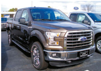
2015 F-150 4X4 Supercrew XLT Stock# T7073

Just Log on to www.joemahandford.com to see your low price today!!