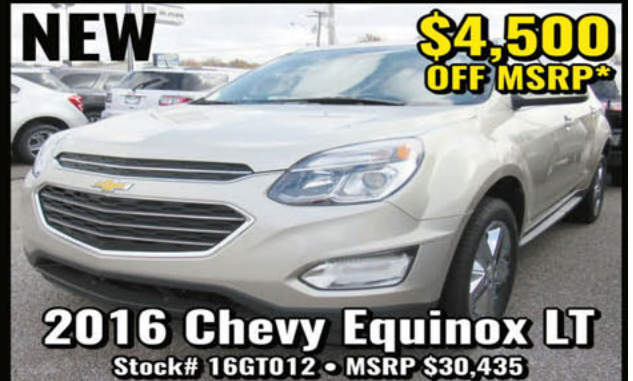
2016 Chevy Equinox LT