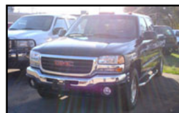
'06 GMC Sierra SLE 4 Door, 4X4, Super Nice! CASH ONLY! $10,500 497