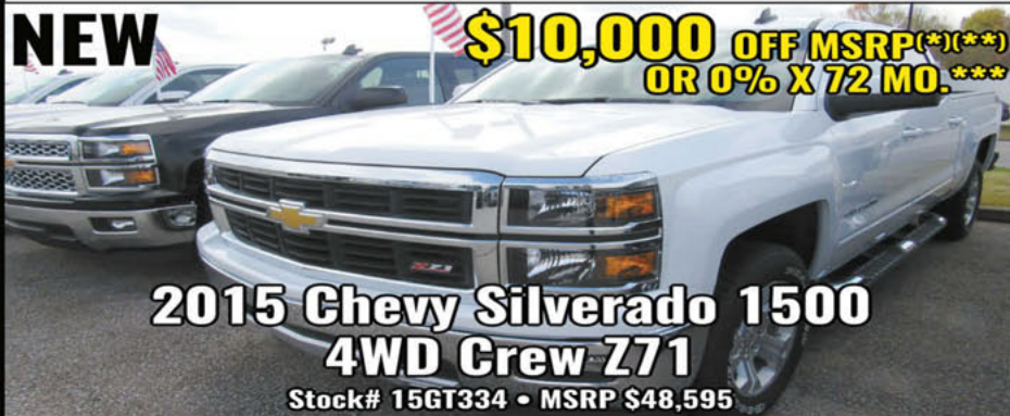
2015 Chevy Silverado 1500 4WD Crew Z71

$10,000 OFF MSRP(*)(**) OR 0% X 72 MO.***