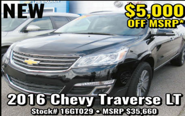
2016 Chevy Traverse LT