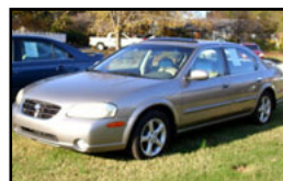
'00 Nissan Maxima Leather, Sunroof, New Tires! Stk#576