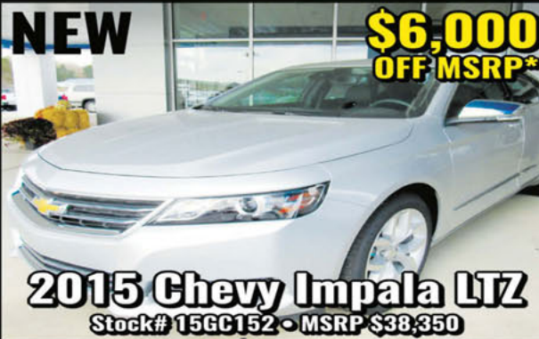
2015 Chevy Impala LTZ