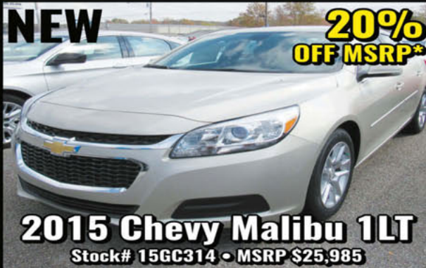
2015 Chevy Malibu 1LT