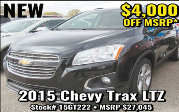
2015 Chevy Trax LTZ