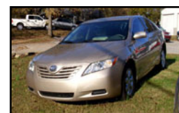
'07 Toyota Camry Sunroof, Leather, Loaded! Stk#586