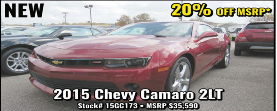
2015 Chevy Camaro 2LT