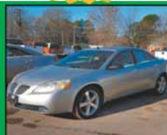
'06 Pontiac G6 Sunroof, Leather, Loaded! Stk#556