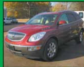
'08 Buick Enclave CXL Leather, Loaded, Super Nice! Stk#641