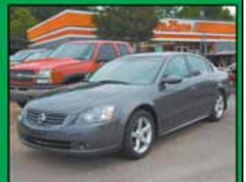
'05 Nissan Altima One Owner, Super Clean, Sunroof, V6! Stk#637