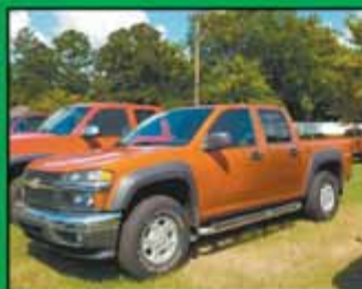
'04 Chevy Colorado Z71 4 door, 4x4! Great Truck! Stk#647

925 Locust Street • Paris • 731-642-5300