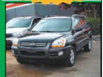
'06 Kia Sportage 4X4, Sunroof, Very Clean! Stk#635