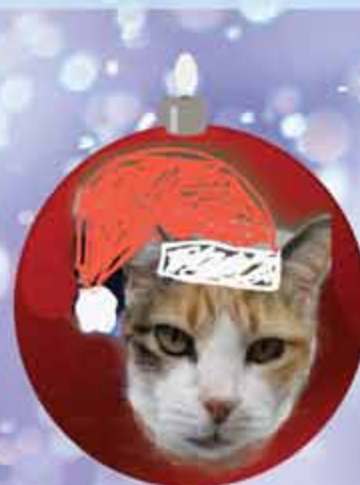
Cricket the Radio Cat