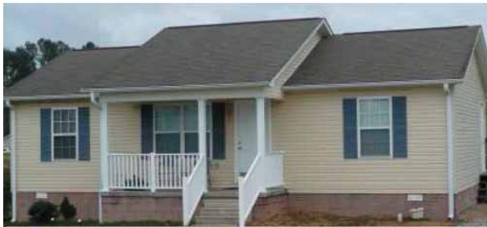
(Home Shown With Optional: Gutters, Porch Rails, Brick Appearance Foundation, Upgraded Concrete Porch & Steps)

Why pay rent or live in a mobile home when you can have this "custom built" Three-bedroom home with two full baths constructed on your level lot