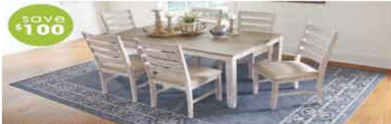
Distressed White Dining Group Includes rectangular table & 6 chairs was $749.99 | $43.33 per month* *Total of payments necessary to acquire ownership is $1,039.98 over 24 months