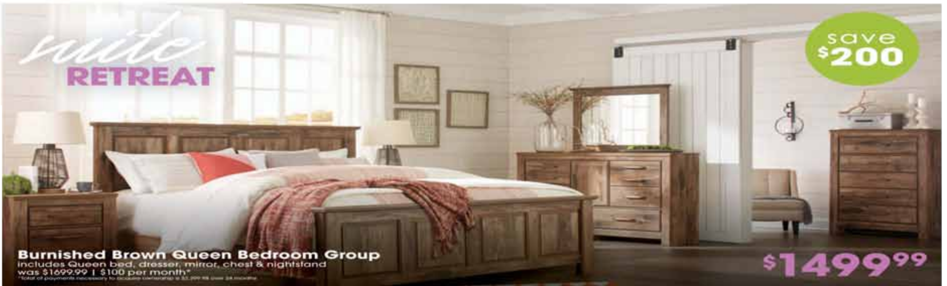
Burnished Brown Queen Bedroom Group Includes Queen bed, dresser, mirror, chest & nightstand was $1699.99 | $100 per month* *Total of payments necessary to acquire ownership is $2,499.98 over 24 months