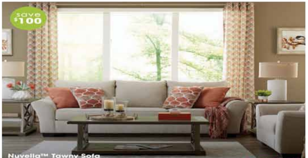
Nuvela™ Tawny Sofa Stain and abrasion resistant fabric! was $699.99 | $40.00 per month* *Total of payments necessary to acquire ownership is $959.98 over 24 months