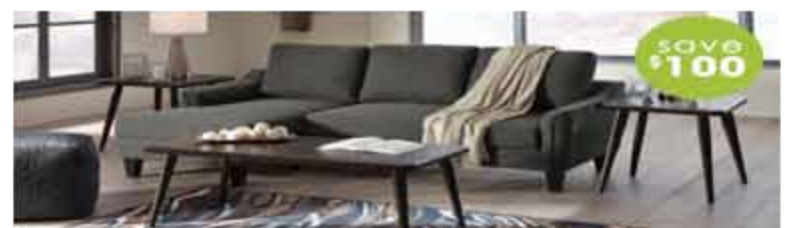
Gray Sofa Chaise Sleeper Available in 2 Colors was $699.99 | $40.00 per month* *Total of payments necessary to acquire ownership is $959.98 over 24 months