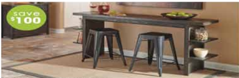
Slender Counter Table with side shelves was $399.99 | $20.00 per month* *Total of payments necessary to acquire ownership is $479.98 over 24 months **Bar stools sold separately