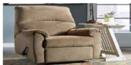
Recliners starting at $199 $13.27 per month* *Total of payments necessary to acquire ownership is $318.40 over 24 months