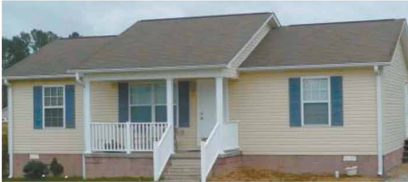
(Home Shown With Optional: Gutters, Porch Rails, Brick Appearance Foundation, Upgraded Concrete Porch & Steps)

Why pay rent or live in a mobile home when you can have this “custom built” Three-bedroom home with two full baths constructed on your level lot