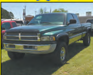
'98 Dodge Ram 2500 Quad 4 door ext cab, Cummins turbo diesel, 4x4! Stk#676