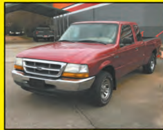
'99 Ford Ranger Ext. Cab, Local Trade! Stk#668