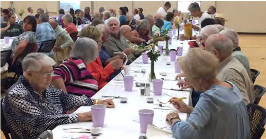
The Henry County Relay for Life held their Annual Survivor’s Dinner on Saturday, May 13th at the First United Methodist Church in Paris. The Paris Elks Lodge hosted the Survivor’s Dinner for more than 17 years and the dinner was free to every survivor and one guest. There were over 175 survivors along with their guests who attended the dinner. The Henry County Relay for Life Survivor’s Dinner is held every year to honor all of those who have survived and persevered past cancer in order to celebrate another birthday and help others who are fighting to defeat cancer. A special thanks goes out to the Paris Elks Lodge, the First United Methodist Church, the HC Relay for Life and all of the volunteers who helped put on the Henry County Relay for Life Survivor’s Dinner.