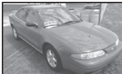
2004 OLDS ALERO, Red, 4 door, 163k miles. $2,200 Call Today: 270-753-5562.

1999 MERCURY GM, 89K miles, full power & leather, $3200, great condition. 2010 Chevy HHR, 116K miles, silver, $4500. 731-641-6388, 731-501-0300.