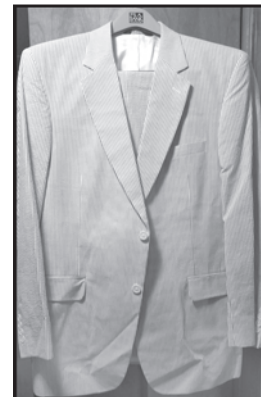
BLUE AND WHITE SEERSUCKER SUIT from Jos. A Bank, 43 long, never worn $75. Call 731-336-5692.

WHITLOCK TRAILERS & PARTS: bearings, bushings, brakes, couplers, hanger kits, hubs, jacks, LED lights, ramps, shackles, u-bolts, grease plugs caps. 731-642-8420.