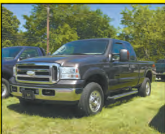
'05 Ford F250 SuperDuty Ext. Cab, 4 Door, 4X4, Local Trade, Michelin Tires! Stk#665A

Call Aviation Institute of Maintenance 800-481-7894