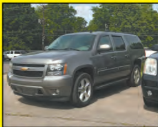
'07 Chevy K1500 Suburban LT 3rd Row Seat, Sunroof, Leather, Loaded! Stk#659