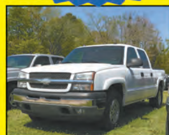
'05 Chevy Silverado Z71 Leather, 4X4! Stk#651