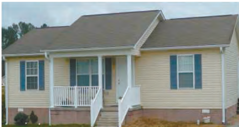
(Home Shown With Optional: Gutters, Porch Rails, Brick Appearance Foundation, Upgraded Concrete Porch & Steps)

Why pay rent or live in a mobile home when you can have this “custom built” Three-bedroom home with two full baths constructed on your level lot