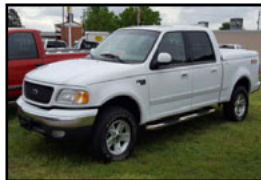
'03 F150 SuperCrew Lariat 4 Door, 4X4, Sunroof! Loaded, Keyless Entry! Stk#633