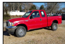
'02 Ford F250 SuperDuty 4X4, 4 Door, Ext. Cab Stk#578