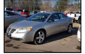
'06 Pontiac G6 Sunroof, Leather, Loaded! Stk#556