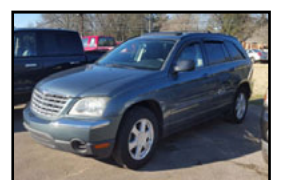
'06 Chrysler Pacifica Leather, Sunroof, Loaded! Great Family Car Stk#616

MULTIPLE FINANCING OPTIONS AVAILABLE! BUY • SELL • TRADE WE FINANCE!