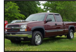
'03 Chevy Silverado Z71 4 Door, Ext. Cab, 4X4! One Owner, Extra Nice! Stk#631