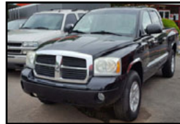
'05 Dodge Dakota 4 Door, Leather, 4X4! Stk#514