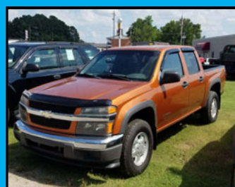
'05 Chevy Colorado 4x4, Low Mileage, Excellent Truck! Stk#644