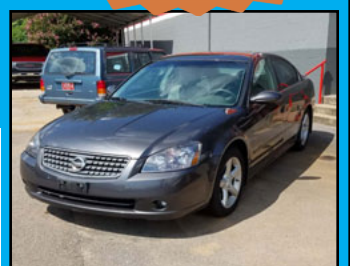
'05 Nissan Altima Sunroof, Loaded, New Tires, v6! Stk#637