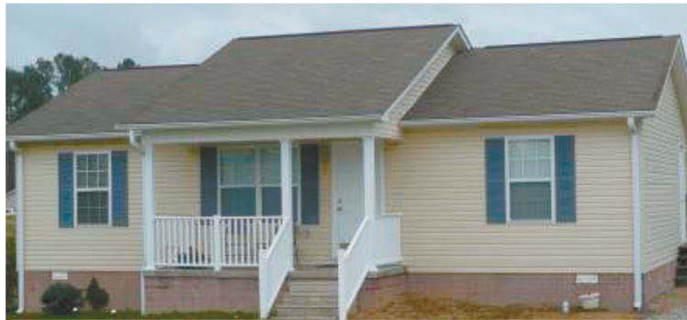
(Home Shown With Optional: Gutters, Porch Rails, Brick Appearance Foundation, Upgraded Concrete Porch & Steps)

Why pay rent or live in a mobile home when you can have this “custom built” Three-bedroom home with two full baths constructed on your level lot