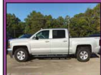
'15 Chevy Silverado 4 Door, 4X4, Bed Cover, Nice! Stk#829