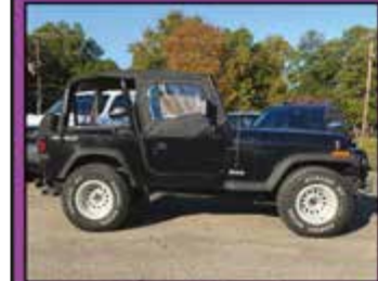
'95 Jeep Wrangler 4X4, Great Hunting Vehicle! Stk#836A