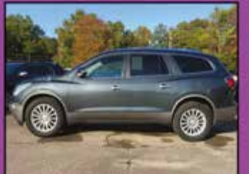
'12 Buick Enclave Leather, 3rd Row Seat, AWD! Stk#837