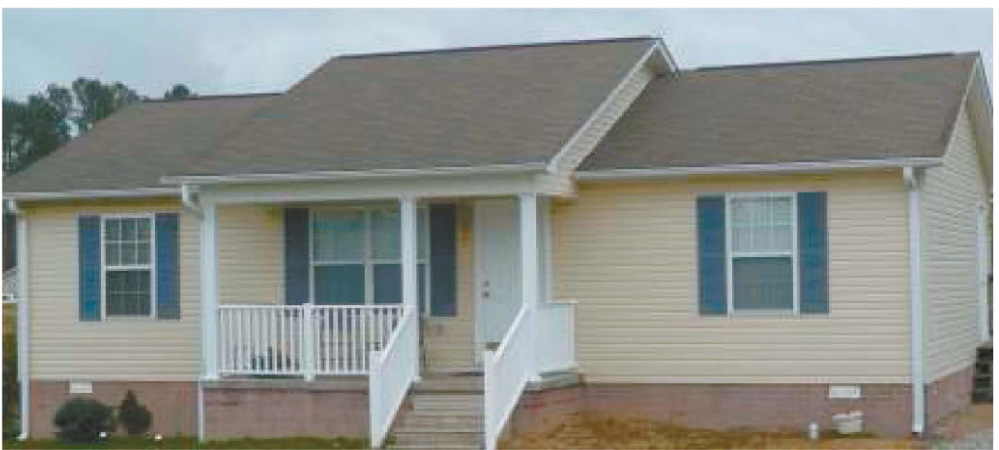
(Home Shown With Optional: Gutters, Porch Rails, Brick Appearance Foundation, Upgraded Concrete Porch & Steps)

Why pay rent or live in a mobile home when you can have this "custom built" Three-bedroom home with two full baths constructed on your level lot