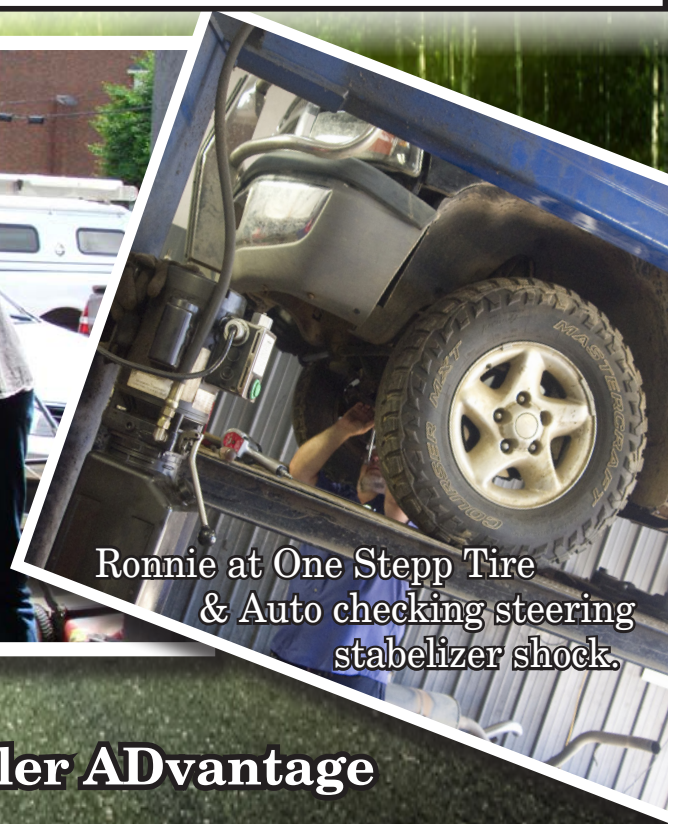
Ronnie at One Stepp Tire & Auto checking steering stabilizer shock.

A Special Supplement of the Peddler ADvantage