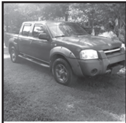
'02 NISSAN FRONTIER, 4WD, 4 door, 5 speed. $5,500 firm. 931-266-9642

2019 FORD F150 XLT, 4X4, Supercrew, 3.5L, V6, EcoBoost, 18k miles, white, one owner, bed cover & bed liner. $45,000. 731-336-7798.