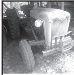
'53 FORD JUBILEE TRACTOR, runs good, good tractor. $3,500 firm. 931-266-9642

ALLIS CHALMERS 50-43 Diesel, runs very good, good tires, $2400. Paris Area 731-676-0267.