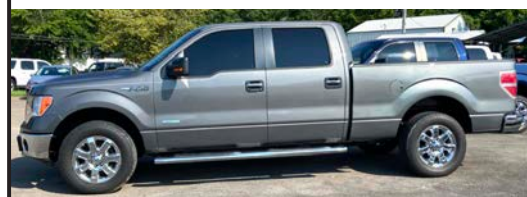
'13 Ford 4X4 EcoBoost 4 Door, Nice Truck! Stk#882