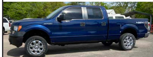
'11 Ford F150 XL 4X4, 4 Door, Power, Local Trade! Stk#870