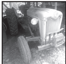
'53 FORD JUBILEE TRACTOR, runs good, good tractor. $3,500 firm. 931-266-9642