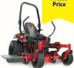
Model shown 76601