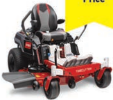
Model Shown 75755