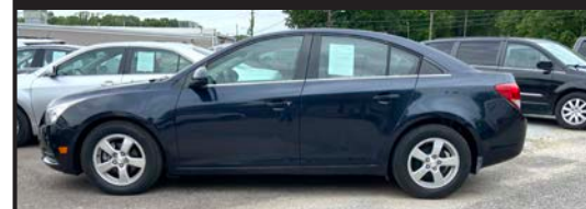
'14 Chevy Cruze LT Sunroof, Good Gas Mileage! Stk#914