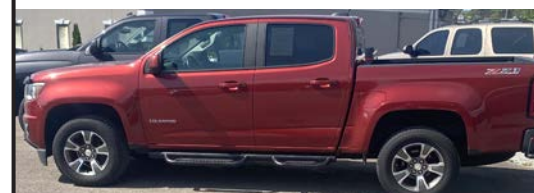
'15 Chevy Colorado Z71 4X4, Leather, Loaded! Stk#925