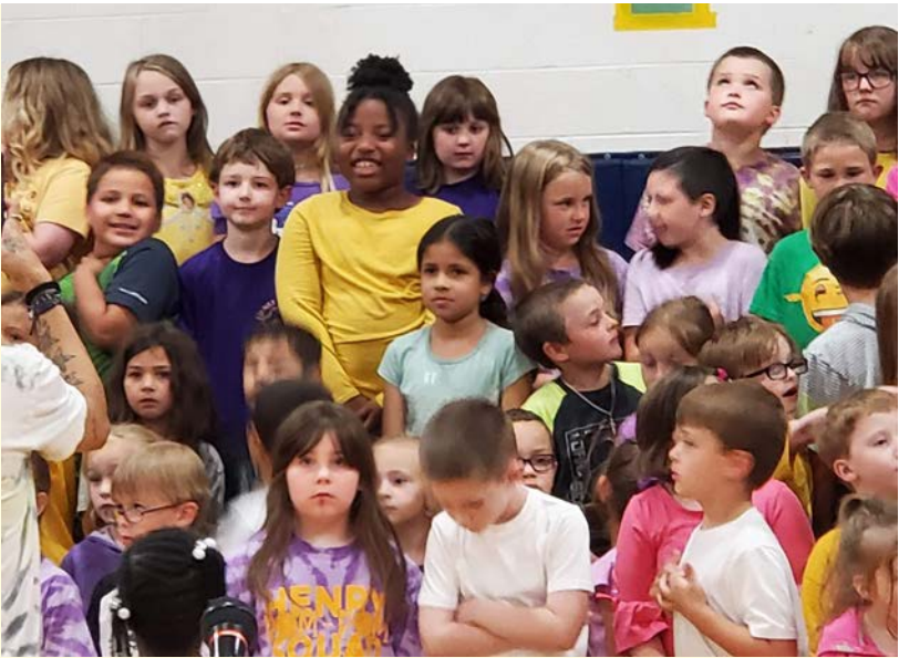
Above & Left: Henry Elementary school Preschool-Fourth Grade sang, played instruments, and did sign language for a large crowd on Friday, May 13th.