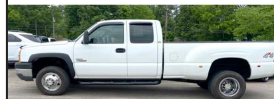
'03 Chevy Silverado 3500 Extended Cab, 4 Door, 4X4, Diesel! Stk#921