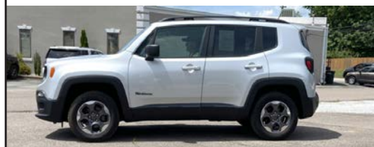
'17 Jeep Renegade 4X4, Super Clean! Stk#929