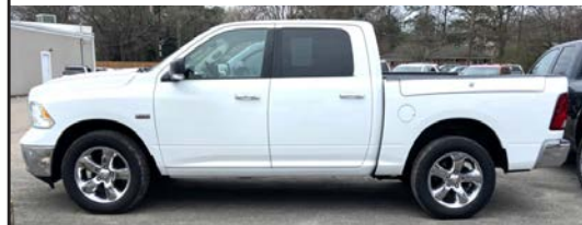
'15 Dodge Ram 4 Door, 4X4, Hemi 5.7L, Ram Box Cargo! Stk#924