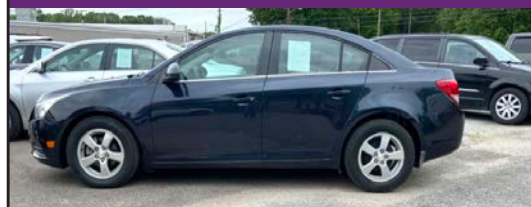
'14 Chevy Cruze LT Sunroof, Good Gas Mileage! Stk#914