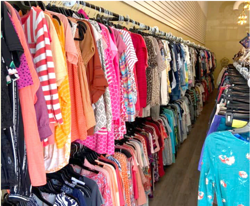
Above and Left: Be sure you stop in and visit The Closet at their NEW location in downtown Paris!! Such a beautiful store! 20% off store wide sale happening now!! Now located at 110 North Market Street. Below: Don't hesitate! Go see our friends at Paint Plus Flooring today and get what you need for your next home project!!